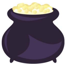
pot of gold